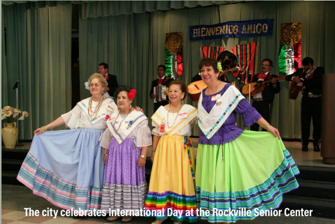
The city celebrates International Day at the Rockville Senior Center