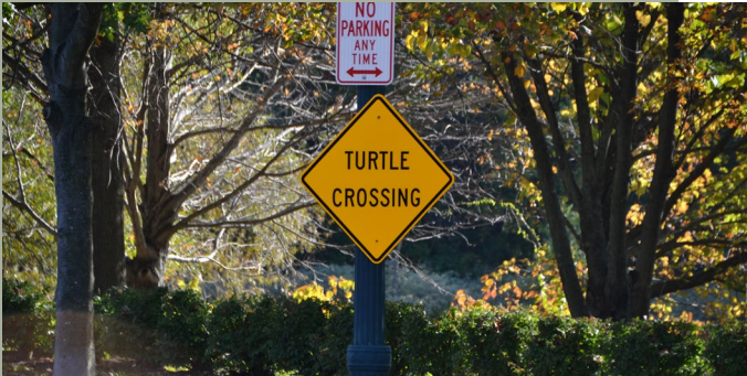
Engineers from Rockville's Department of Public Works took special care to help Watkins Pond's turtles to relocate during a recent stormwater management project.